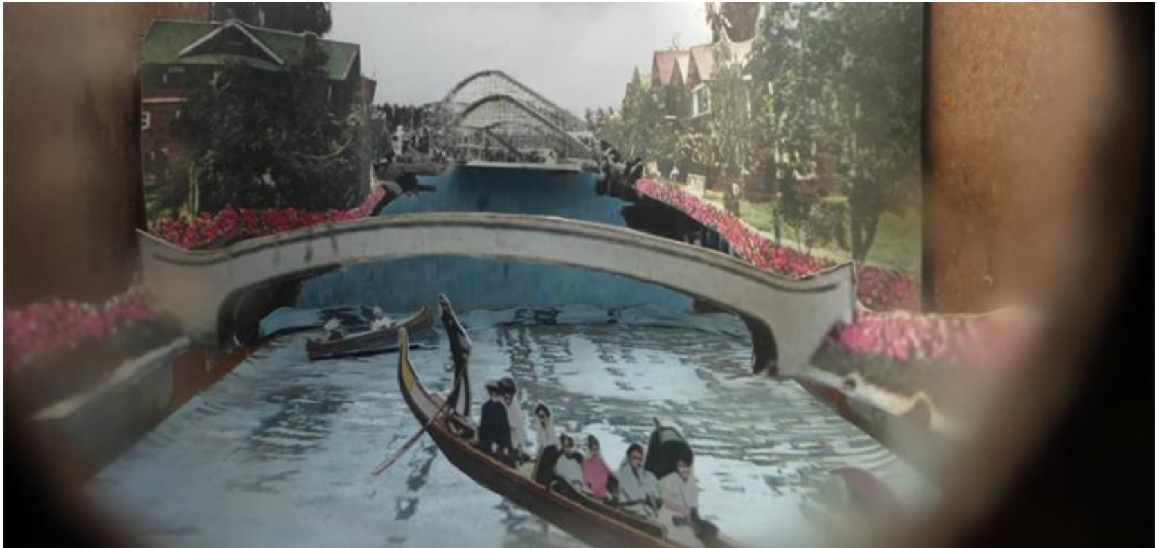
Inside the "Take a Peek"